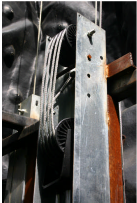
Fig. A1.2 Service Bulletin